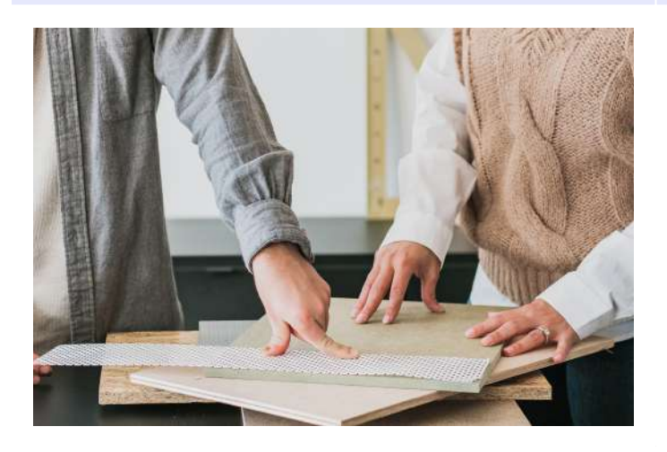
5. Learned Lessons, Improvements and Future Plans